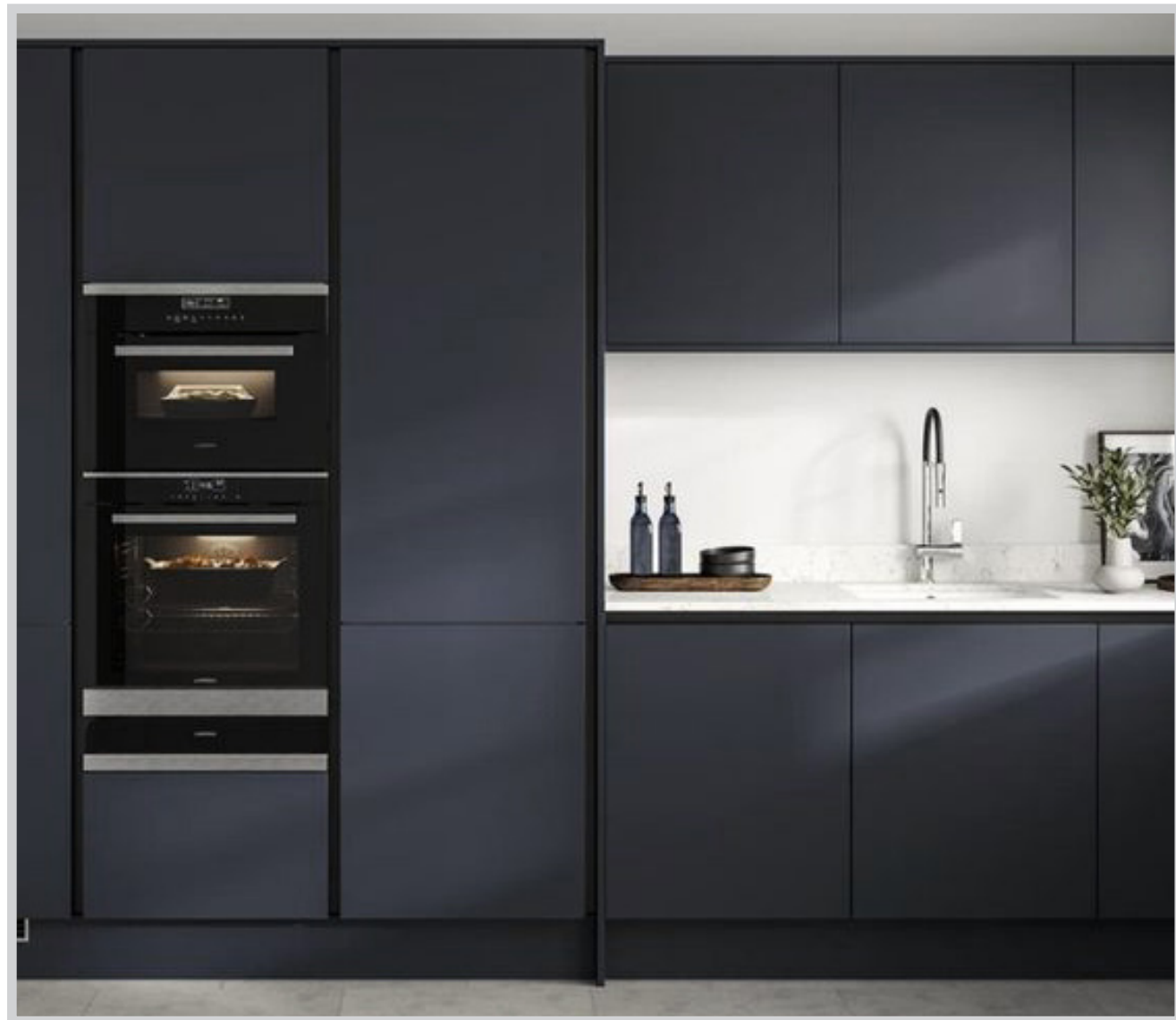
DARK NAVY KITCHEN WITH BRUSHED BRASS TRIM