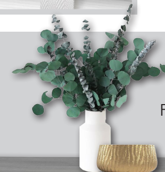
FEATURE LED PENDANT OVER DINING TABLE