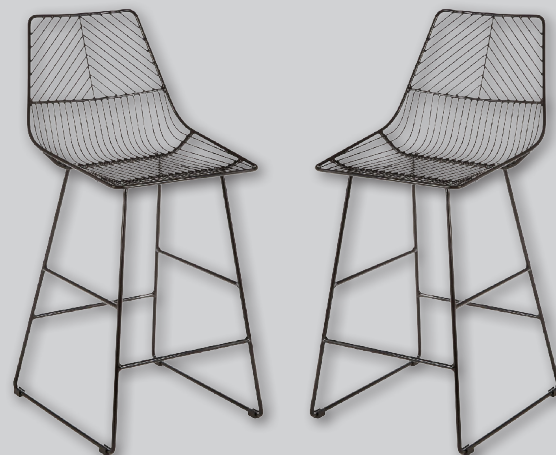
CONTEMPORARY METAL BAR STOOLS