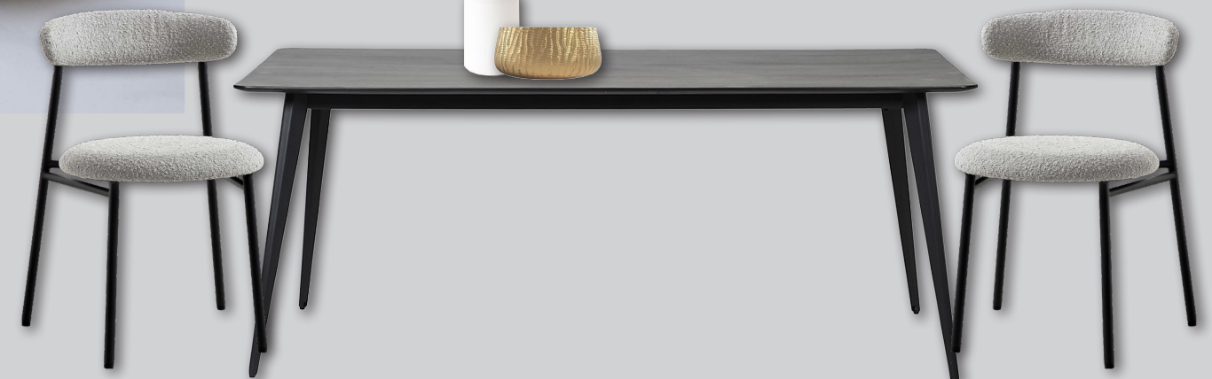
LARGE BLACK DINING TABLE WITH EIGHT CHAIRS